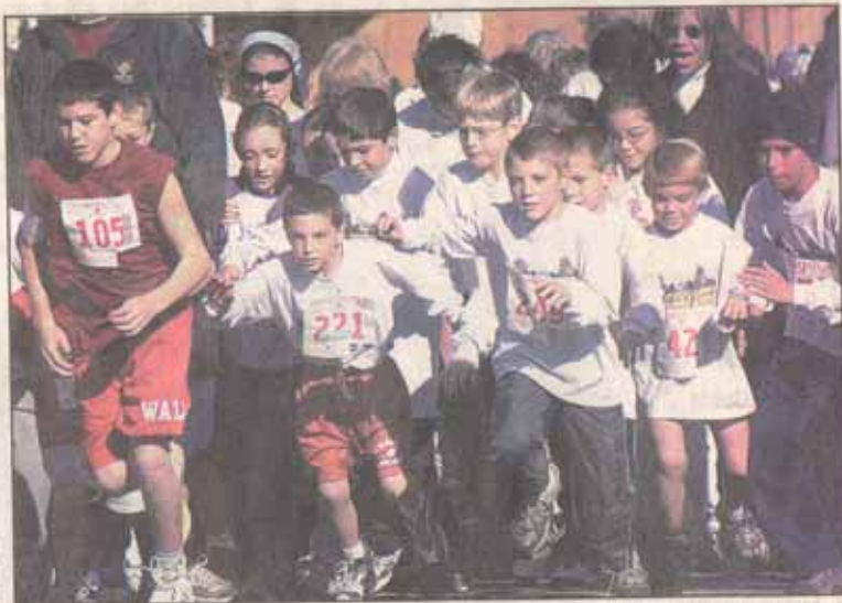
SHAWN HUBER, The Coast Star

A complete account of the results of the Manasquan Turkey Trot will appear in next week's issue of The Coast Star .